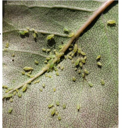
Aphids and their young