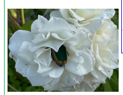
Fig Beetles: In the summer, metallic iridescent green fig beetles loudly announce their arrival with buzzing sounds. They zoom into our garden to feast on our ripe peaches, figs apples and roses. Insecticides are not necessary. Crush them underfoot, clip them in half with your pruners or use the soapy bucket method.

In the summer, metallic iridescent green fig beetles loudly announce their arrival with buzzing sounds. They zoom into our gardens to feast on our ripe peaches, figs, apples and roses. Fig beetle ( Cotinis mutabilis , family Scarabaeidae ) adults are large metallic green beetles that measure up to one to one and one-third inches long. Their habitat is the southwestern United States and Mexico. They have prominent legs and antennae. Some people mistakenly think they are Japanese beetles or June beetles which are pests found in the eastern United States. Fig beetles mate and the female lays oval white eggs in the soil just beneath organic matter. The eggs hatch in a week. During spring, larvae mature and pupate in a cell of soil particles. The larval stage is the longest period of their life cycle. The adults are a menace from late June through to the early fall, actively feeding during the day on soft-skinned ripe fruits such as peaches, apricots, plums, figs and apples. (<a href="http://ipm.ucanr.edu">http://ipm.ucanr.edu</a>) Their gourmet tastes also include rose petals. Again, there is fortunately only a single generation of these beetles each year.