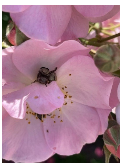
continued on page 13

pinks. If so, there is a good chance that the pests you are dealing with are hoplia beetles. On single-petalled roses, hoplia beetles are easy to spot. They are there in plain view on the petals and in the stamens. On multi-petalled roses you will find them within the folds of the petals. Just follow the holes.