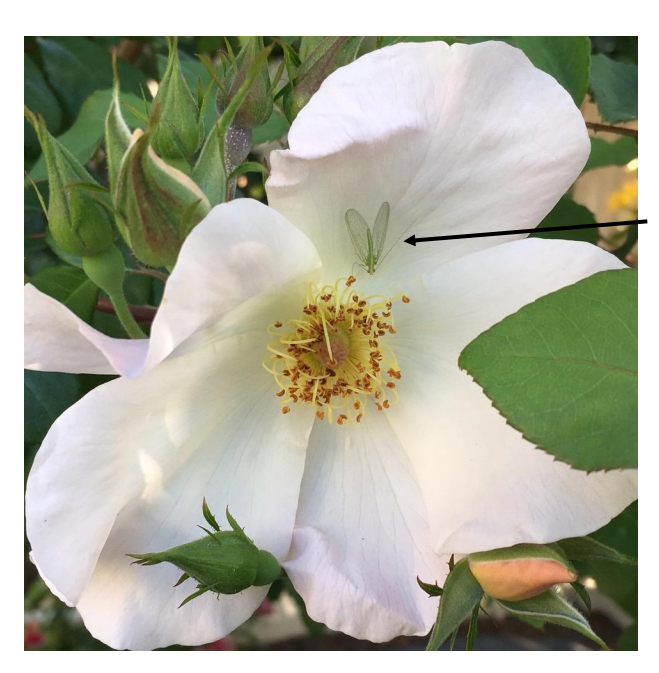
The beneficial lacewing