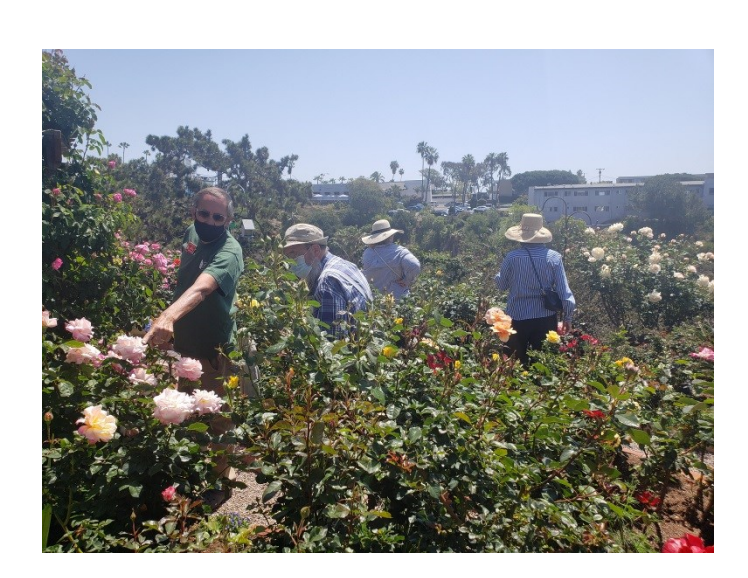
The Garden of Bill and Elaine Ornelas