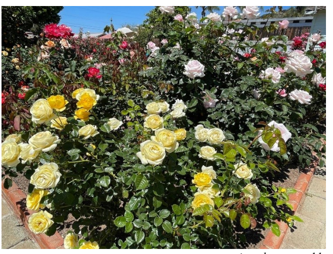
continued on page 11