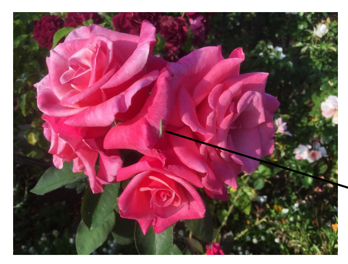
'First Prize' is a Hybrid Tea with huge pink blooms that have outstanding form. Here it has attracted the attention of a lacewing, a beneficial in the garden. Adult green lacewings do not kill insect pests but their larvae do.