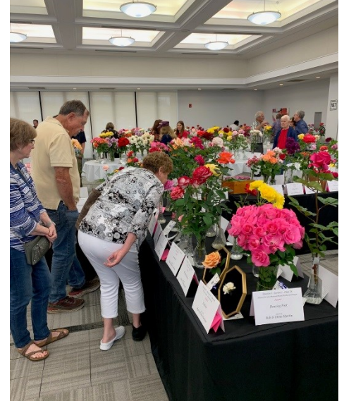
Clockwise from upper left: Show floor; Trophy table; Fragrance table; Trophy table