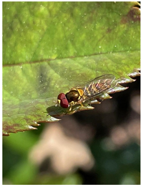
The syrphid fly is a beneficial insect as its larvae rid roses of insect pests including aphids, rose slugs and caterpillars.

Playboy is an eye-catching floribunda with glossy green foliage and ruffled copper-orange petals. It has enticing yellow stamens that attract bees and other pollinators.