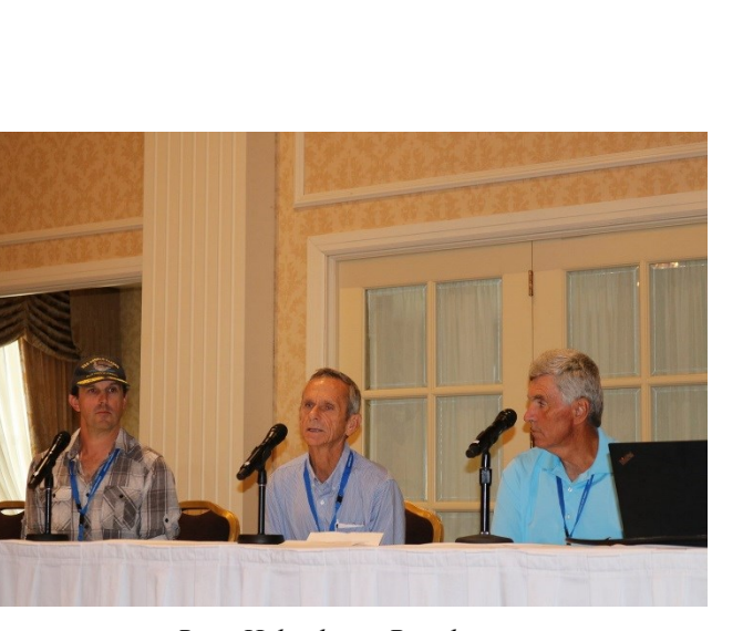
Rose Hybridizers Panel