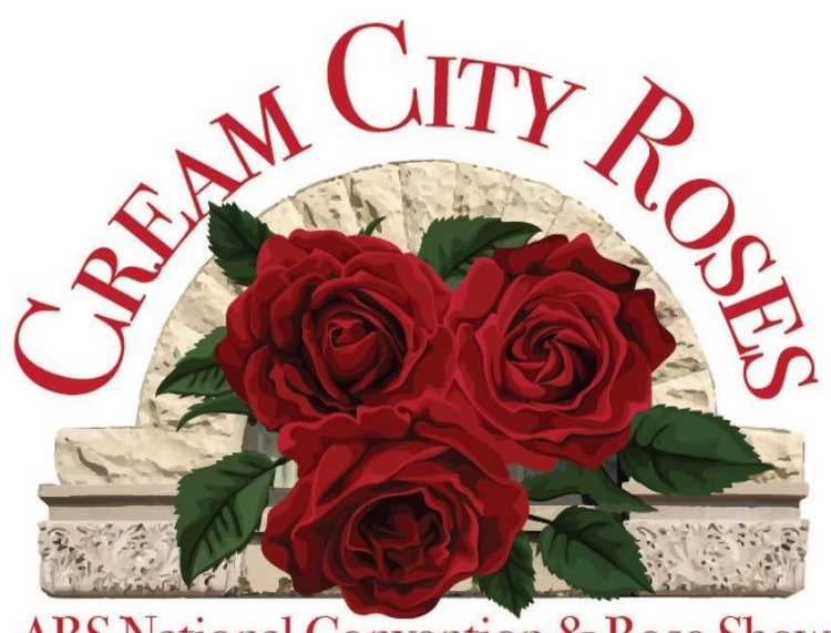
ARS National Convention & Rose Show September 10-14, 2021 – Milwaukee, WI