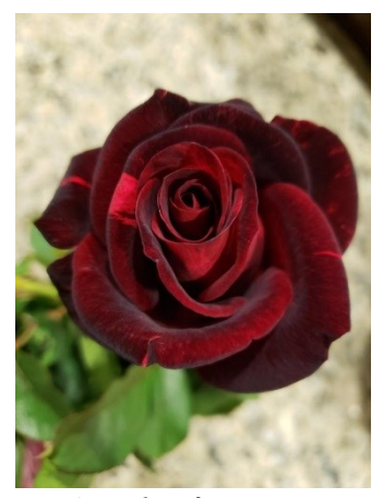
'A Night of Magic'